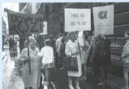
John and Yoko for OZ (above)